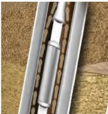
Conventional coupled rod